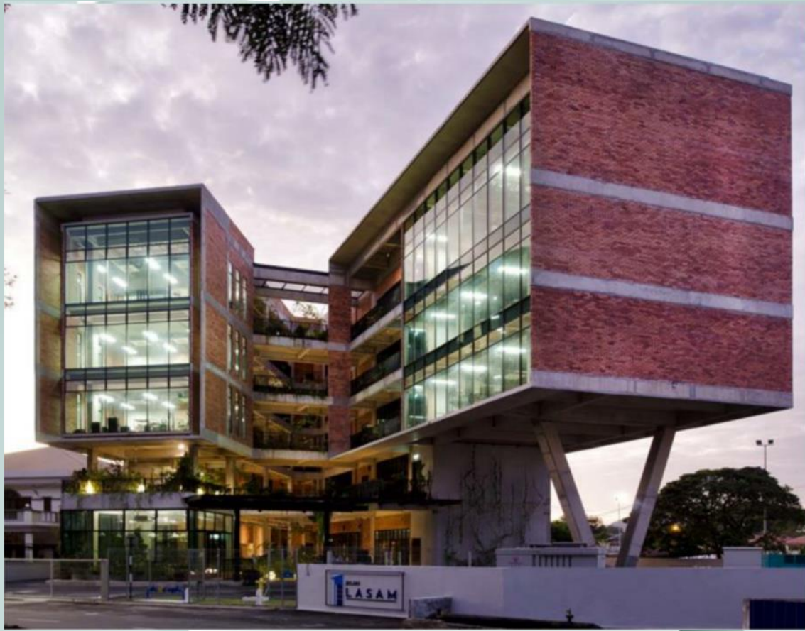
Architect: Kuee Architecture

Register via online registration form on this link: